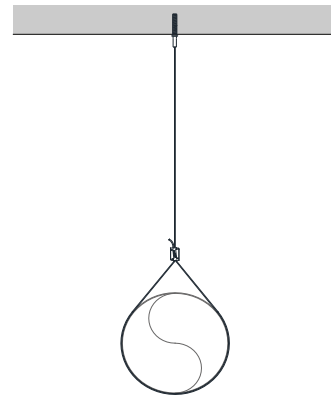
Spiral Duct Stud Up